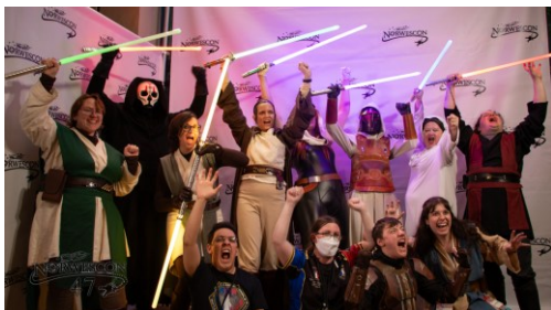
Intermission entertainment by Saber Guild: Kamino Temple