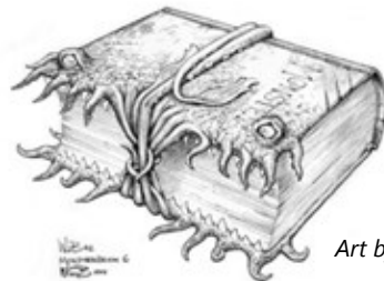
Art by Wayne Barlowe

Send Overheard items to zine@norwescon.org .