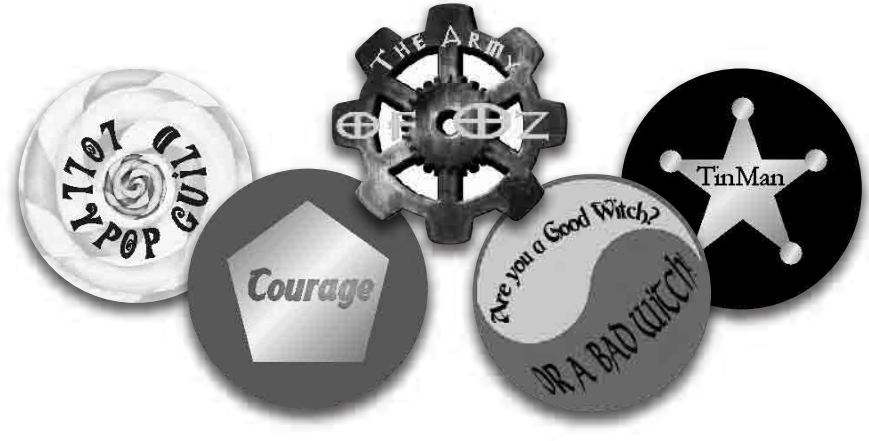
Norwescon 35 Progress Report • March 2012 • 7

Contact us at volunteers@norwescon.org and we'll match your skills and interests with the departments needing help! Remember, the convention is only as good as the people who help behind the scenes!